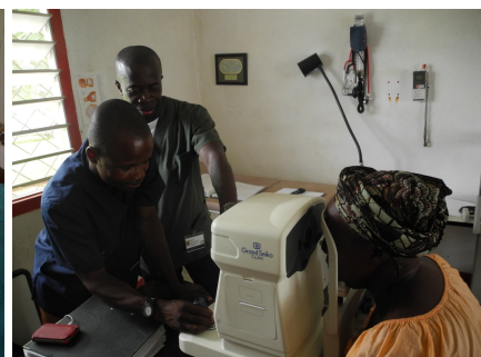
Left: Fig 4: First time on the computer! Fig 5: One-to-one teaching; Right: Fig 6, 7 & 8: Ophthalmology class in Nursing School