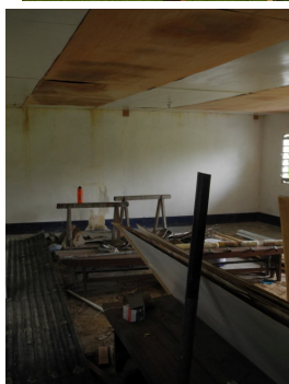
Fig 8. Before renovation