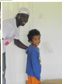
Figs 9 & 10 The Samoutou children came to help!