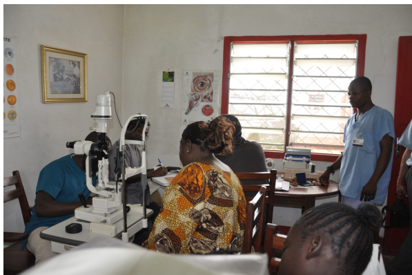
Fig 3. Our former Eye Clinic

Our old clinic was too small and dark for us to examine eyes properly. (Fig 3) We had to go outdoors to test for visual acuity. (Fig 4) We had no space for medicine and glasses. With increasing number of patients (Fig 5), it was time to move!