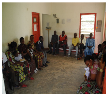
Fig 5. Our Former Waiting Room

We decided to convert an old Sunday school building into our new eye clinic until we can build our own dedicated eye centre. We built an extension to it, created a water supply, and gave it a make-over! After several weeks of hard work, we moved in and are loving our new home!