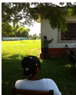
Fig 4. Outdoor consultation